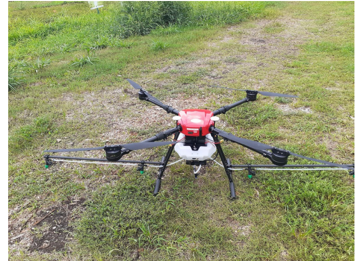
Aerial pesticide application