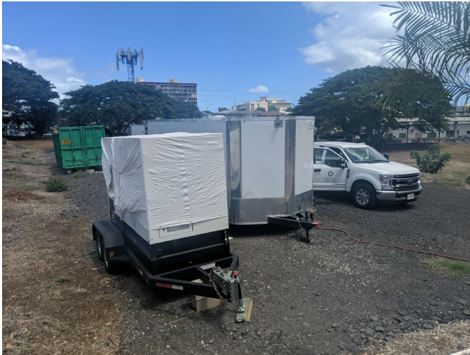
Mobile vacuum steam unit