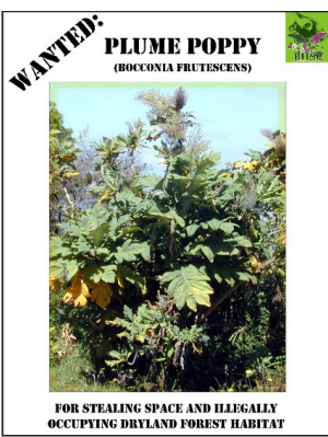
Photo: A few of the new BIISC display posters for community outreach