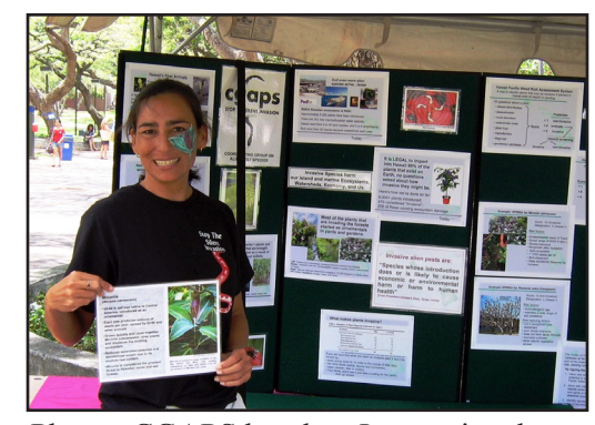
Photo: CGAPS booth at International Society of Arborists community fair at UH Manoa