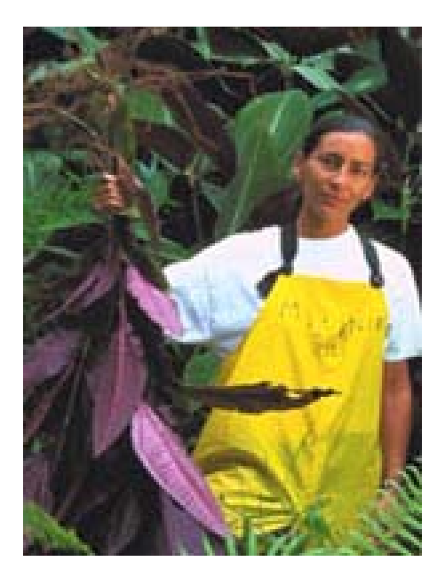
Photo 1: Some examples of work with journalists, Photo 2: USFWS funded video Miconia Threatens editors and partner agencies that resulted in Maui aired statewide on OC 16's Outside Hawaii. outreach aimed at different audiences.