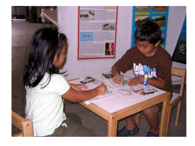
Photo 6: Kids color miconia, coqui, little fire ant points out forest invasives at the Jumping the and brown treesnake pictures at the BIISC booth at the Hawaii County Fair.