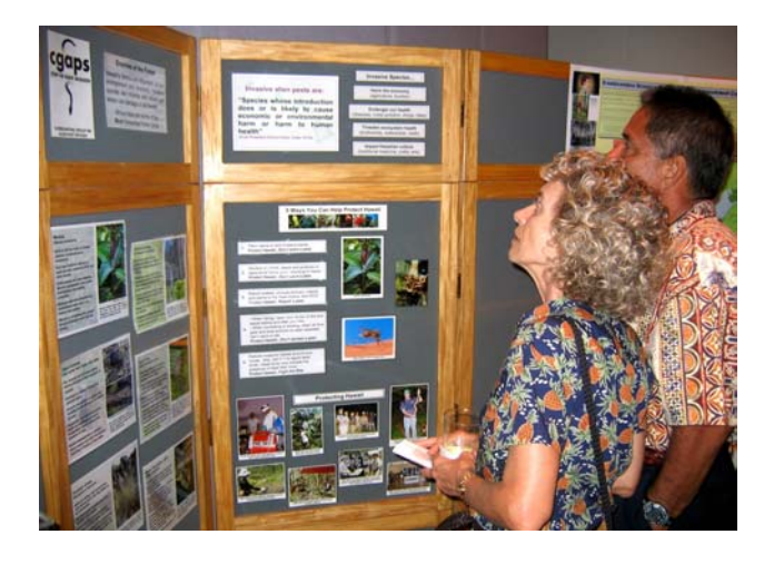
Photo 4: CGAPS display at the Forest Industry Association's Hawaii Woodshow at Aloha Tower.