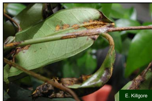
Figure 2. Rose apple with typical symptoms of yellow ring patterns on foliage followed

Symptoms. Symptoms of the disease first begin as tiny bright yellow powdery eruptions in a circular pattern on the leaf or stem surface (Fig. 1). These infection loci or spots expand and become necrotic (Fig. 2), and spread over the entire leaf, stem, or shoot. Leaves and stems can be deformed by the disease (Fig. 3 and 4), and growing tips can die back if the infection is severe. These symptoms are more likely to be seen on tender, young growing points.