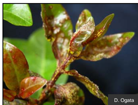
Figure 4. Advanced disease condition on ohia plant.