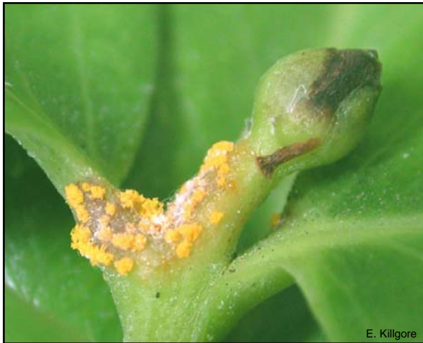
Figure 1. Early symptoms of rust disease on ohia