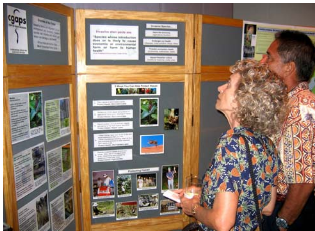
Photo 4: CGAPS display at the Forest Industry Association's Hawaii Woodshow at Aloha Tower.