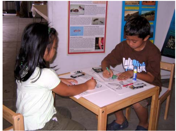
Photo 6: Kids color miconia, coqui, little fire ant and brown treesnake pictures at the BIISC booth at the Hawaii County Fair.